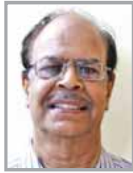
By C K Subramaniam

It is important to make a distinction between inaccurate news and "fake news" which has been created and disseminated with malicious intent. This requires a deeper understanding of not only the phenomenon of "fake news" but of the dynamics of social media and the Internet. Revoking a poor order was a good first step.