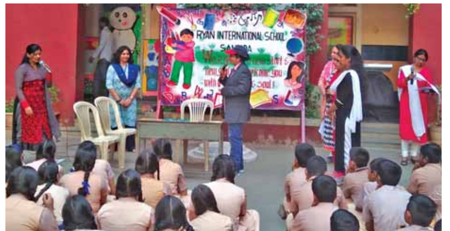
Teachers presenting a skit based on human and moral values

By Ashok Dhamija NAVI MUMBAI: Big dreams and soaring aspirations marked the beginning of the new academic session 2018-19 at Ryan International School, Sanpada. On the occasion a special assembly was conducted for the Montessori, Primary and Secondary section by the teachers of the institute. It was a colorful and lively affair commencing with the prayers and worship songs. A skit was performed by all