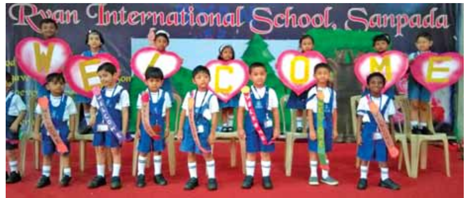
Montessori students being welcomed with cards, badges and sashes