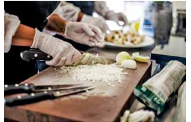
FSSAI has been in the forefront to enforce Food Safety and Hygiene Standards at Restaurants and Food Outlets