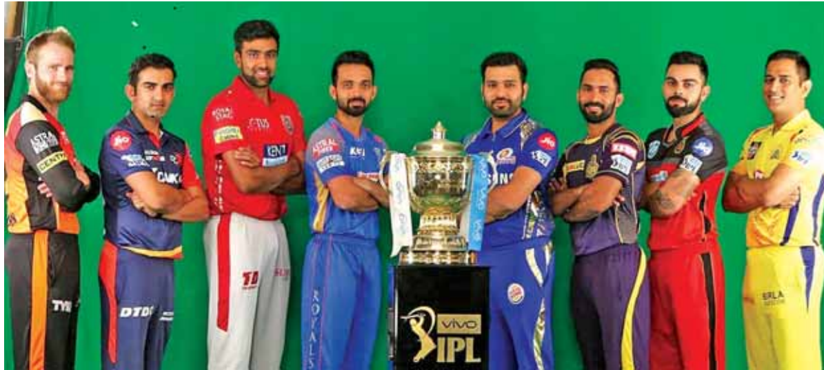
Captains of the eight participating teams who agreed to abide by the Spirit of the Game pose with the VIVO IPL Trophy 2018 prior to the start of the tourney

On a track that had seam movement and bounce, CSK were down in the dumps as they lost eight wickets with only 118 runs on the board, midway in to the 17th over, while chasing 166 at the Wankhede Stadium late on Saturday night. 20 year old debutant leg-spinner Mayank Markande (3/23) who came into bowl in the seventh over of the innings struck twice in as many overs, after all-rounder Hardik Pandya (3/24) who had suffered a collision with Bravo while batting, bowled through considerable pain and scalped two early wickets for the hosts. Markande trapped former Mumbai Indians opener Ambati Rayudu (22) and CSK skipper MS Dhoni (5) leg before with his deceptive googlies and latter had Deepak Chahar stumped by former Indian U-19 Indian 2016 ICC World Cup skipper Ishan Kishan for a golden duck. Needing 47 from 18 balls, the former West Indian skipper Bravo who came in at number seven, stood tall amidst the ruins. He took on MI's experienced death over specialist Mitchell McLenaghan (1/44) and Jasprit Bumrah