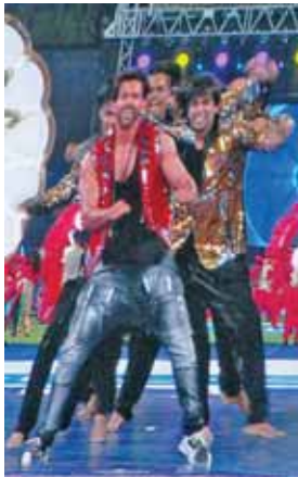
Bollywood heartthrob Hrithik Roshan grooving to his dance moves to the tune of his popular numbers.

opening ceremony of the VIVO IPL 2018 held at Wankhede Stadium in Mumbai. Held before the before the opening league match between Chennai Super Kings and defending Champions Mumbai Indians, two of the most successful teams in the history of the tourney, an musical extravaganza from none other than Mika Singh who crooned his latest chartbusters numbers had the audi-