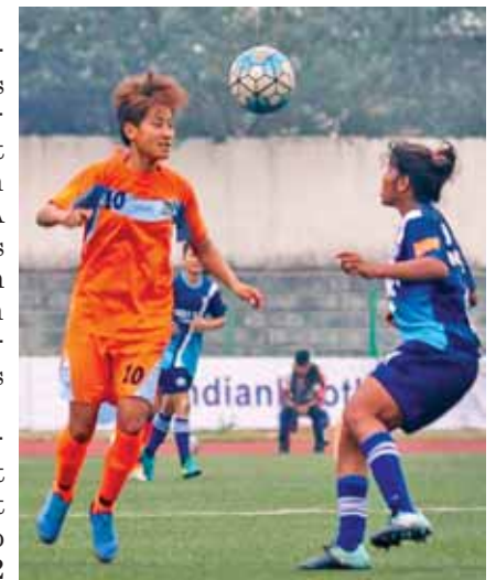
For representational purpose only

All the interested players are requested to come for the trials as it is a great opportunity to showcase their talent at such a big platform. Only players who are born on or before 31st December 2002 are eligible to for the trials.