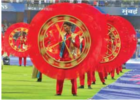
Hundreds of cricketing and entertainment fans were spellbound by the synchronised performance of supporting artists with fancy props, drum rolls etc.

MUMBAI: Tens and thousands of fans at the Wankhede Stadium were treated to a grand spectacle of rocking dance performances by Bollywood heartthrob Hrithik Roshan, Varun Dhawan, Prabhu Deva the ever effervescent actresses Jacqueline Fernandez and Tamannaah Bhatia during the