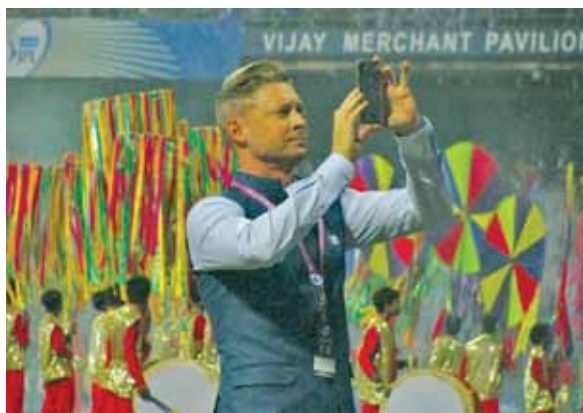
Former Australian skipper Michael Clarke who is one among the many expert commentators couldn't resist taking a photo of the spectacular opening ceremony.

opening ceremony of the VIVO IPL 2018 held at Wankhede Stadium in Mumbai. Held before the before the opening league match between Chennai Super Kings and defending Champions Mumbai Indians, two of the most successful teams in the history of the tourney, an musical extravaganza from none other than Mika Singh who crooned his latest chartbusters numbers had the audi-