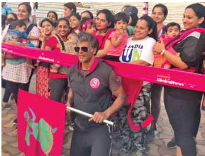
Milind Soman poses along with Pinkathon Mothers who along with their babies too participated in the event.

"Pinkathon is more than a Marathon. It is the seed of change and open to all first timers. The first step is taking control of your own health, respecting yourself and understanding and celebrating the value you bring to your family and society. Empowerment is not a gift of society; it is a gift you give yourself. We are happy that around 2300 participants were associated with Aditya Birla Health Insurance Co. Limited (ABHICL), unique campaign of #JumpForHealth today, which aims to donate prosthetic leg to the under-privi-