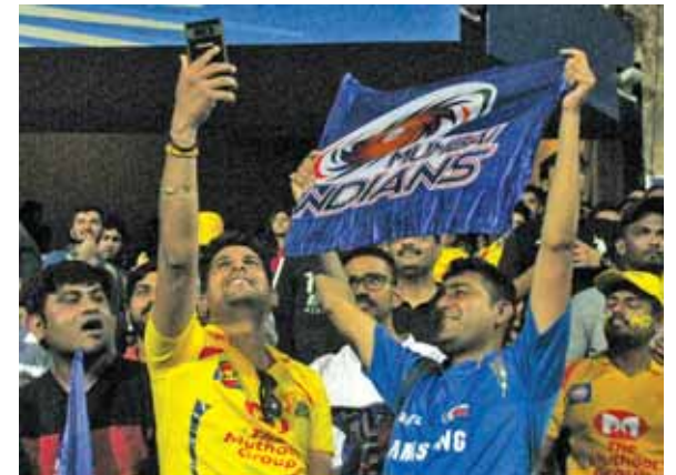
Cricket the unifying factor...Fans from two of the best teams in the history of the tourney, Chennai Super Kings and Mumbai Indians pose for a selfie moment.

midwicket with disdain, before scoring a hat-trick of boundaries off Bravo. He was however dismissed by Watson in the 13th over. South paw Kishan (40) used his feet well even against Chahar and took a strong liking for South African leg-spinner Imran Tahir (1/23), whom he hit for 4, 6, 4 and collected a total of 17 runs in the eleventh over before falling victim to the same bowler in the 15th over. Pandya brothers Krunal (41 n.o.) and Hardik (22 n.o.) latter put on a crucial unbeaten 52 runs stand for the fifth wicket off only 32 balls despite Bravo's (0/25) crucial spell in the death. He conceded only 7 runs bowling the 18th and 20th overs of the innings and deceived