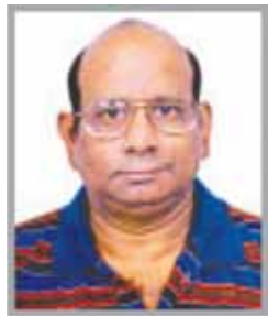
By Lakshman Sundar

International Airports are like the UN General Assembly. You come across many nationalities from many countries under one roof. The world's 20 busiest airports, as designated by Airports Council International, welcomed 1.5 billion