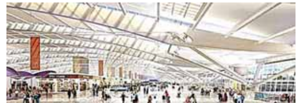
London's Heathrow International