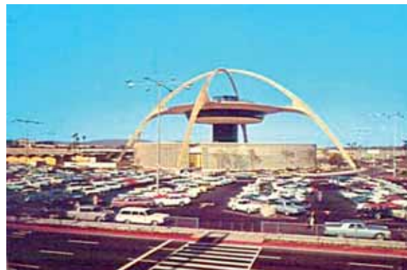
Los Angeles International