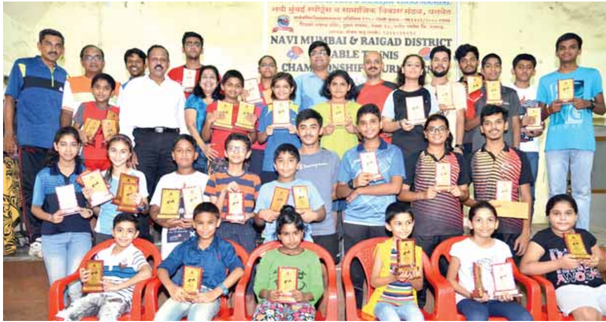
Finalists across various age groups and open categories pose with their respective trophies in presence of the dignitaries.