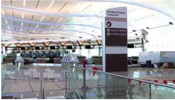
Atlanta's Hartsfield-Jackson International