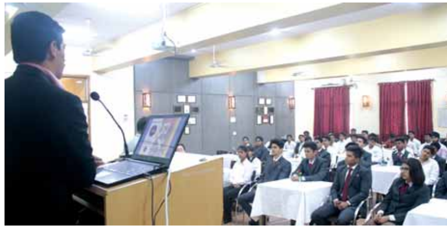
The participants listen in rapt attention to the sharing by industry expert during the national level workshop organised by D. Y. Patil University School of Hospitality & Tourism Studies, Nerul on the importance of Concierge in Hospitality & Tourism.

personal incidences at ITC Maratha Sheraton. In hotels or resorts, a concierge assists guests by performing various tasks such as making restaurant reservations, booking hotels, arranging for spa services, recommending night life hot spots, booking transportation