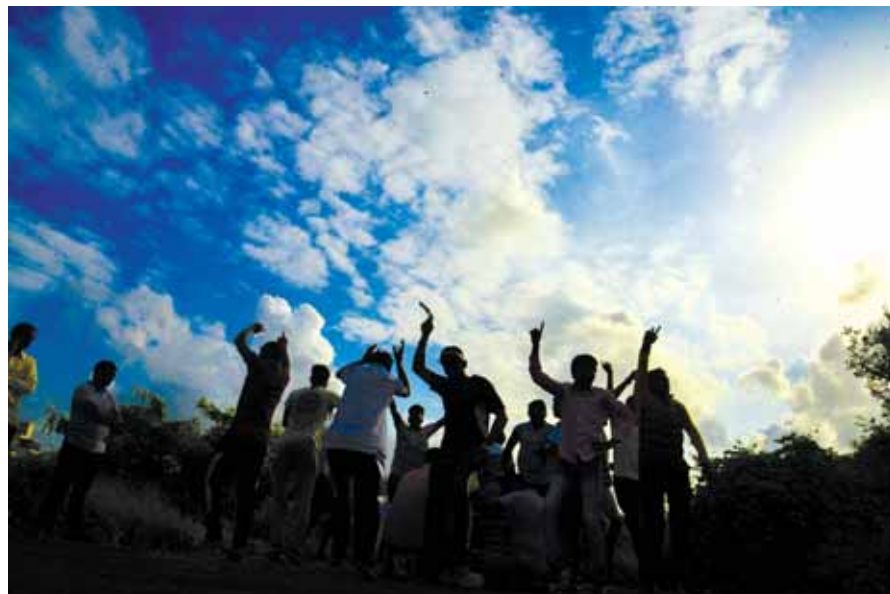
Few days are left for Ganesh Festival and hence practice of Konkani type of dance is being done by a Dance Institution.