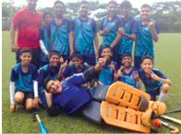
St. Xavier's Airoli players along with their coach are elated after regaining the under-14 Boys Navi Mumbai District DSO Hockey title.

NAVI MUMBAI: St Xavier's High School, Airoli Under-14 Boys retained the Navi Mumbai District DSO Hockey crown by defeating arch rivals St. Augustine High School, Nerul by 1-0, played on the artificial synthetic turf at the Fr. Agnel Multipurpose Sports Complex in Vashi on Wednesday September 5, 2018. In the process the Airoli