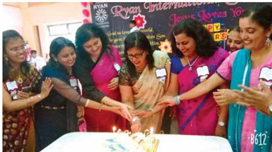
The Ryan Sanpada students as a mark of respect for their teachers arranged for a cake cutting ceremony.

NAVI MUMBAI: A teacher is an inspiration, motivation & foundation for a student's development. Ryan International School, Sanpada celebrated Teachers Day on September 5, 2018 with great enthusiasm. A special assembly which commenced with special prayers organized by the students kicked off the day long celebrations. The school ambience reverberated with fun and laughter as students wished their teachers with flowers and cards. They left no stone unturned in making the teachers feel special. The teachers too danced and sang