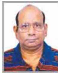
By Lakshman Sundar

• Teachers' Day should be followed by Lecturers' Day dedicated wholly, solely and exclusively to wives worldwide!