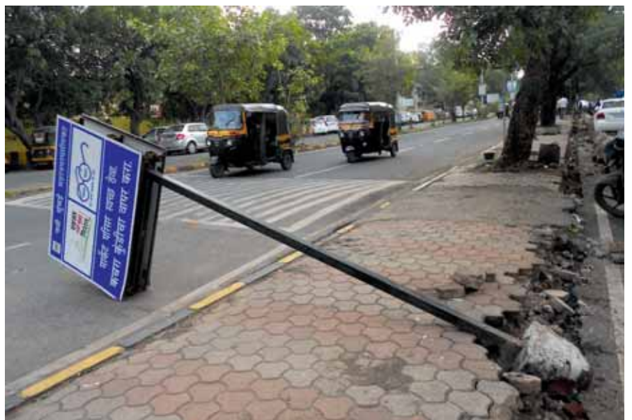
A NMMC Signage promoting 'Swaachh Navi Mumbai Abhiyan' partially blocks the road and footpath adjoining Vegetable Market near Vashi Bus Depot after negligence by contract workers involved with the repair works on Wednesday